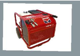
HPP13D FLEX DIESEL

MULTI means many. This power pack has the most different flow settings on the market. No other hydraulic power pack features as much as 8 different flow settings.