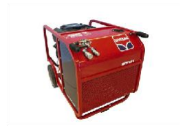
HPP18V FLEX GASOLINE

With its infinitely variable flow adjustment from 1x20-30 l.p.m., the HPP13 FLEX can be used for many tools.