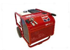
HPP13 FLEX GASOLINE

HYCON HPP09 is the most popular power pack, and it is used especially for rental, contractors, municipalities, supply companies (power, water, gas, heat, sewage, telecom) etc. the power pack most often use 20 l.p.m. tools like breakers, core drills, saws, submersible pumps etc.