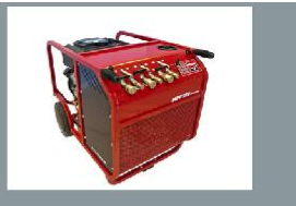
HPP18V MULTIFLEX GASOLINE

The HYCON HPP23V FLEX hydraulic power pack is designed in accordance with the EHTMA categories C, D, E and F, which prescribe a performance of 20 l.p.m., 30 l.p.m., 40 l.p.m and 46 l.p.m respectively at 138 bar.