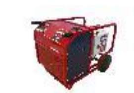
HPP18E FLEX ELECTRIC

The power packs are equipped with a Y/D start function ensuring low start current.