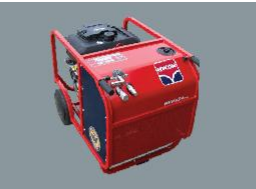
HPP23V FLEX GASOLINE

They are users who often need the high power and who want a robust, high quality 40 l.p.m. power pack.